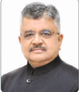
Tushar Mehta, Solicitor General of India