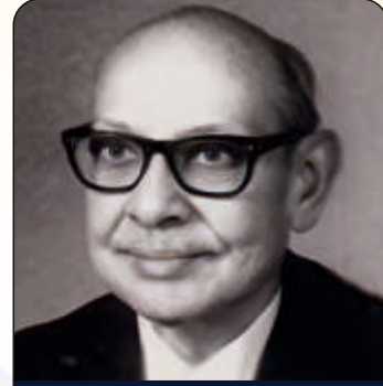
Shri Lal Narayan Sinha 1983 – 1985