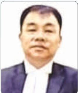
Tadup Tana Tara