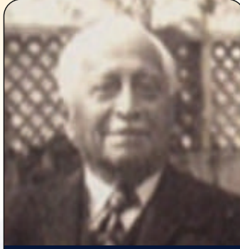
Shri C.K. Daphtary 1974 – 1983