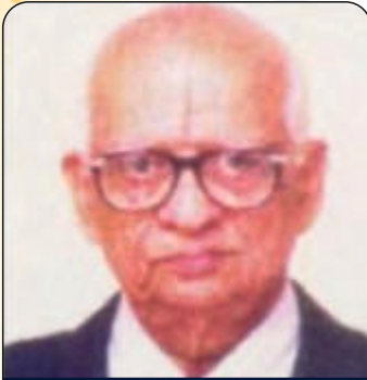
Shri K. Parasaran 1985 – 1991