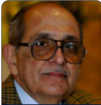
Shri Fali S. Nariman 1991 – 2010