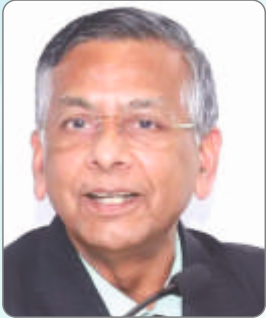
R. Venkataramani, Attorney General for India