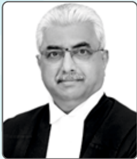
Hon'ble Mr. Justice Aravind Kumar Judge, Supreme Court of India

He has advised clients on pre-litigation settlements and has participated, as counsel, in mediation proceedings conducted under court-annexed mediation centres. These experiences have strengthened his interest in mediation as a structured and effective means of achieving expeditious and amicable resolution of disputes.