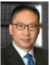
Rimsky YUEN GBM SC JP