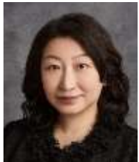
Teresa CHENG GBM GBS SC JP